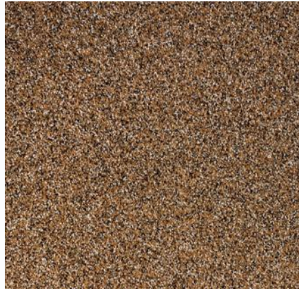
Q28-36 PUMPKIN SPICE