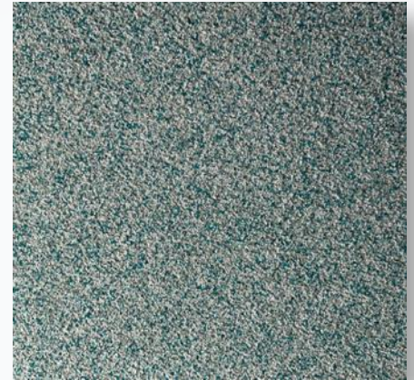
Q28-25 SEA FOAM