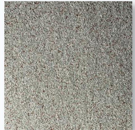
Q28-16 DUSKY NIGHT