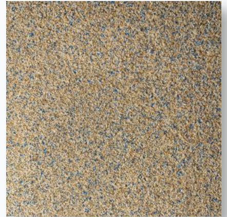
Q28-29 MIDNIGHT DESERT