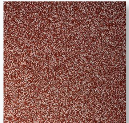
Q28-33 DARK FIRE