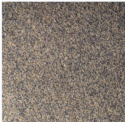
Q28-24 MOON GLOW