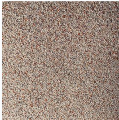
Q28-31 COASTAL AZALEA