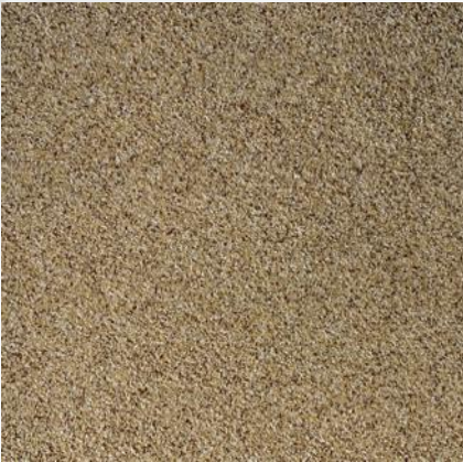
Q28-17 SANDY BEACH