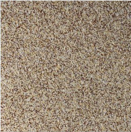
Q28-13 SILKY SAND

It is intended for use over properly prepared vertical above-grade concrete, concrete masonry, Portland cement plaster, stucco, and Decoplast continuous insulation systems.