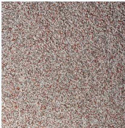
Q28-30 RED STAR