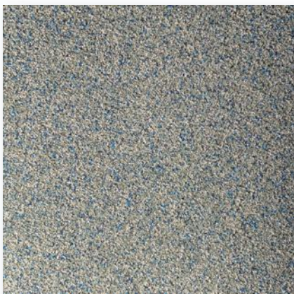
Q28-22 DEEP WATER