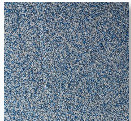
Q28-27 BLUE SKY