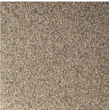
Q28-23 SANDY DUNE